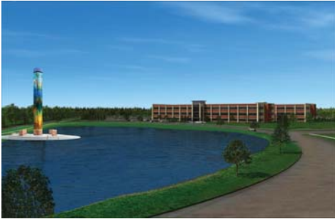
Rendering of Paragon Prairie Tower, Lake and Marsh Building at Paragon Office Park

Located in the Silos and Smokestacks National Heritage Area, the Paragon Prairie Tower was designed to represent the Midwestern work ethic of saving and harnessing our abundant natural resources. It will combine state-of-the-art technology with old world materials and craftsmanship. A colorful shimmering scene will be created on top of panels of pre-cast