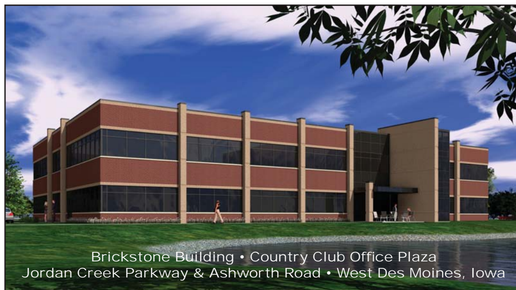
Brickstone Building • Country Club Office Plaza Jordan Creek Parkway & Ashworth Road • West Des Moines, Iowa

R&R Realty Group has begun construction on the Brickstone Building, a new speculative multi-story office building along the popular Jordan Creek Parkway in West Des Moines.