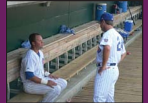
I-Cubs players (above) and fans (below)