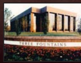
Three Fountains Office Park