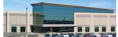
Citigroup at Paragon Office Park