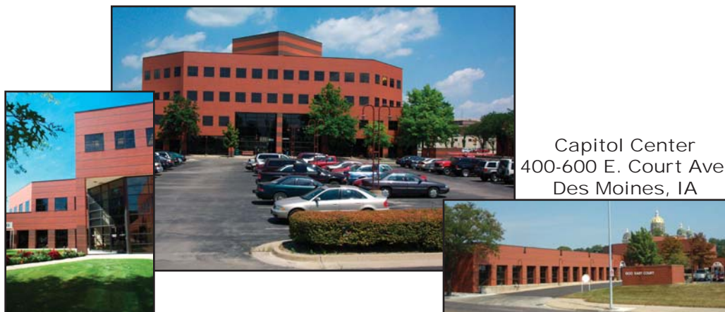
Capitol Center 400-600 E. Court Ave. Des Moines, IA

R&R Realty Group (R&R), one of Central Iowa's largest commercial real estate companies, purchased Capitol Center, a three-building office development, on January 12, 2006 from Glenborough REIT. The property is located at 400 (Capitol Center III), 500 (Capitol Center II), and 600 (Capitol Center I) East Court Avenue in Des Moines, Iowa. Capitol Center is positioned on the east side of the Des Moines Central Business District in close proximity to the Capitol for the State of Iowa.