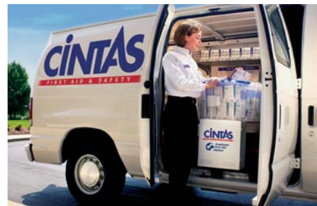
Located at Aurora Business Park 11079 Aurora Avenue

Located in Aurora Business Park in Urbandale, Cintas First Aid & Safety has been serving the Des Moines Metro Area for the past 2 1/2 years. This is a business sector of Cintas Corporation, which Fortune Magazine has named as one of America's Most Admired Companies for the past four years running.